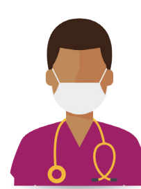
Public Health Nurse